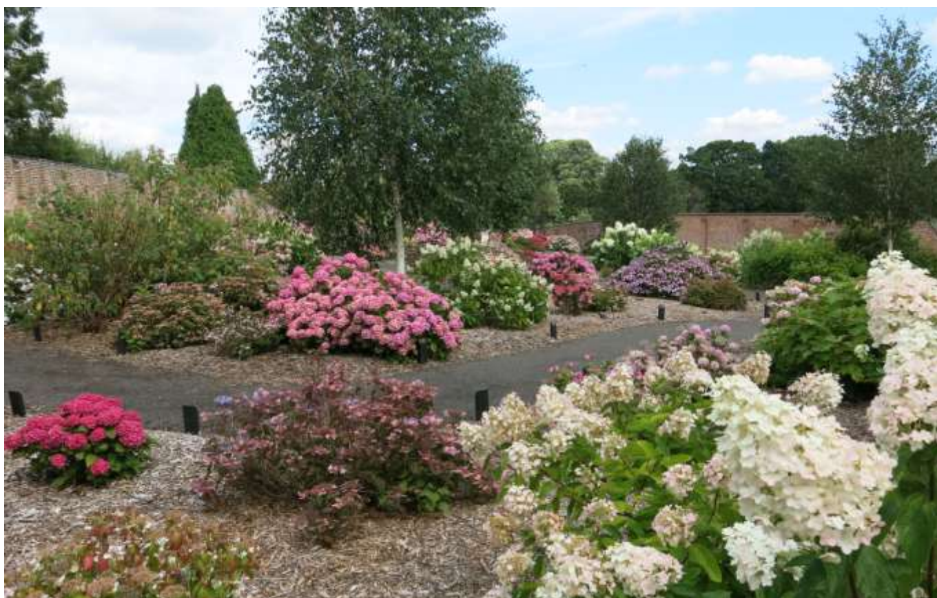
Darley National Park, Derby