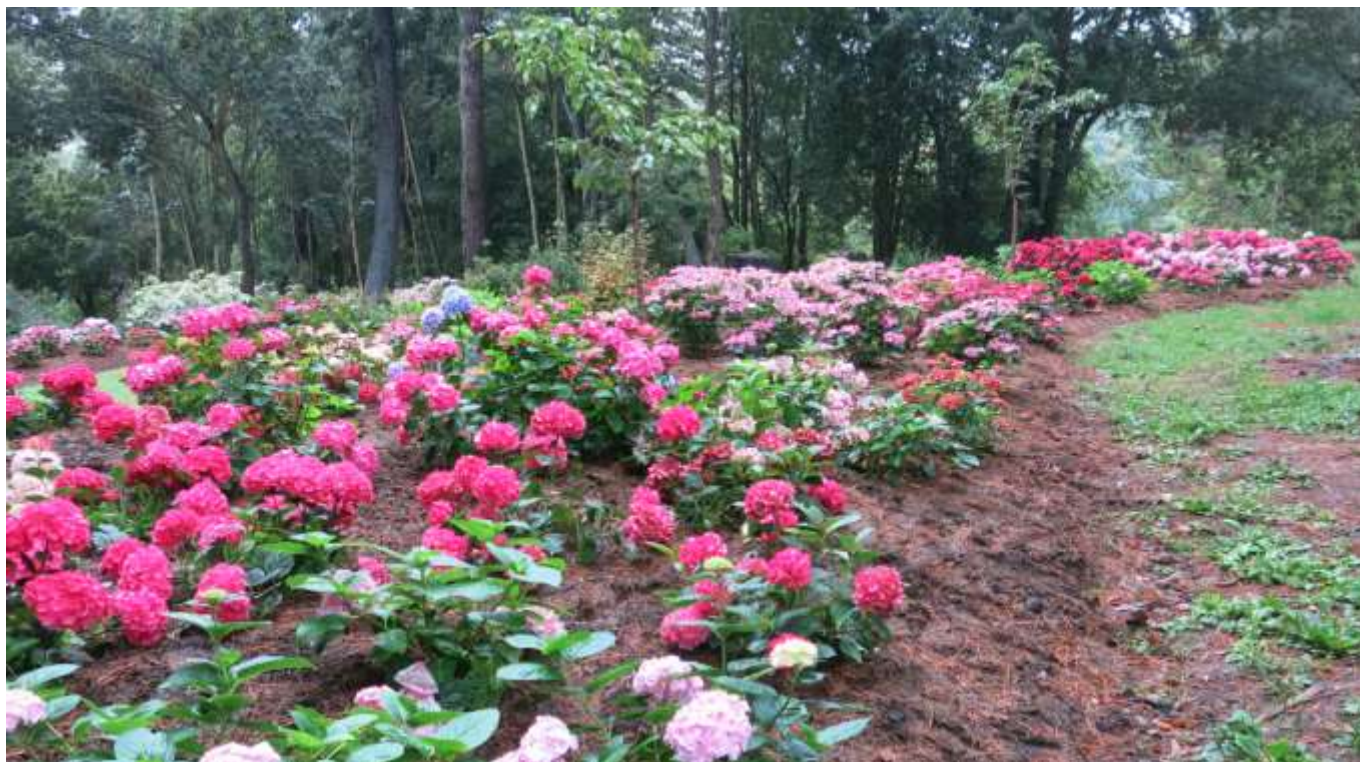
Abbotsbury Sub Tropical Garden, Dorset